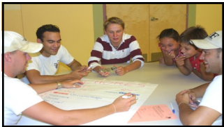
Youth Involvement—teaching one another.