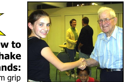
Life skills & Manners