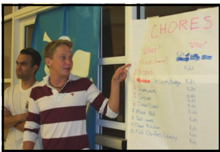
Discussing discipline & family chores.

Search Institute's Asset #1—Family Support