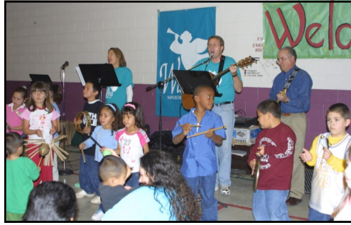
Everyone joins in the singing!