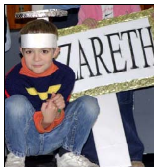
Angels wearing Christmas sweaters!

Guideposts has a goal of reaching 400,000 hand-knit sweaters by the end of 2006. We thank Wings for helping us reach our goal! Yarn of all colors, crochet hooks and plastic knitting needles of all sizes can be shipped directly to me at Guideposts Magazine for further distribution to knitters all over the world.