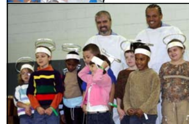
"Share Christmas program with loved ones."