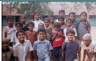
Children in India pray for the Wings visit.

Wings Ministry is a 501(c)3 organization and can accept United Way contributions from anywhere in the U.S.