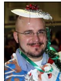
Angels come in all sizes!