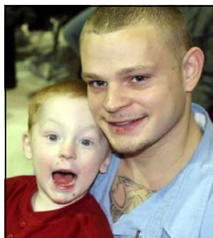
"I love my son very much."