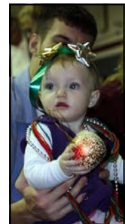
A living doll holds onto her ornament in Daddy's arms.