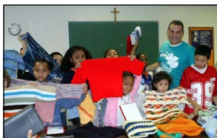
Gorgeous sweaters everywhere!