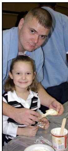
"Spending time... making cookies."