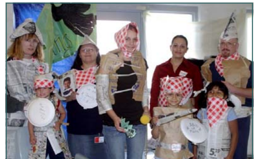
New outfits for State Fair after the Table Game.