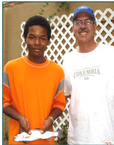
Mentoring & fishing go hand-in-hand