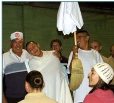
Bible Study —Jesus and His disciples in the boat, including a towel sail.