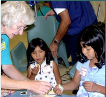
Fruit Loop Necklaces

Participants listed highlights including: