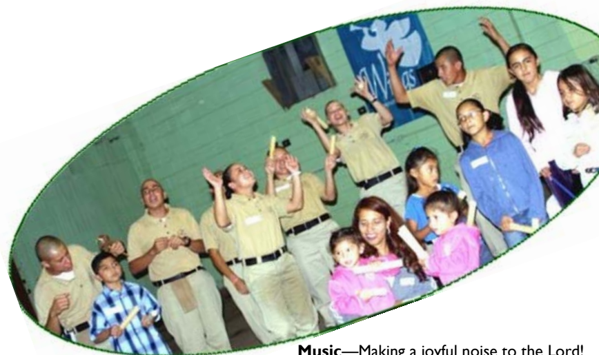
Music —Making a joyful noise to the Lord!