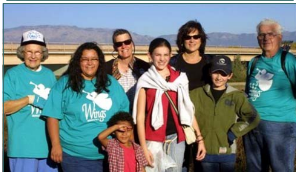
Some of the Wings volunteers and families during the hike and clean-up along the Rio Grande Bosque in Albuquerque.