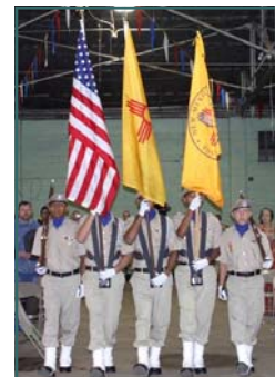
The Color Guard officially started the Wings Party with the presentation of flags.