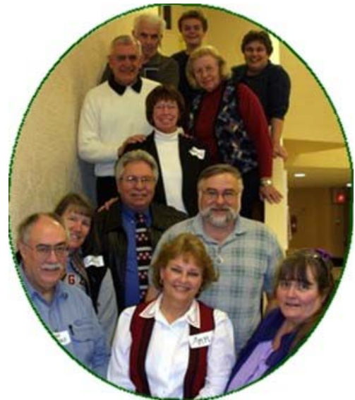
Members of the Wings Board gather at Trinity @ the Marketplace

Wings Ministry is a 501(c)3 organization and can accept United Way contributions from anywhere in the U.S.