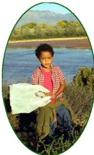
Even the littlest ones helped!