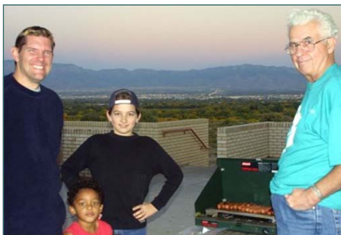
After the work—it's time for hotdogs.