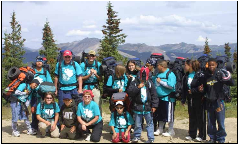
Backpacking in Colorado

Youth generally will follow positive leaders – especially peer leaders. I am recommending that monies given for "children of prisoners camping programs" be earmarked differently. Allocate the same money to provide partial scholarships for prisoners' children. (I believe each camper should earn part of his or her fees to instill a sense of responsibility and appreciation.) Find denominational camps and church