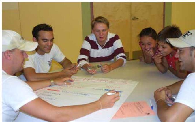
Above: Teens teaching & discussing discipline & chores

Wings for L.I.F.E. has begun and we are having great fun! Each meeting we identify one of the 40 Developmental Assets from Search Institute.