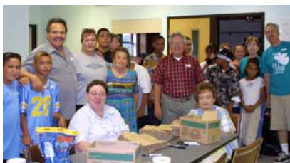
Rio Grande Food Project Community Service—Bagging Beans, Rice, & Coffee