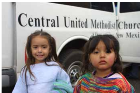
Left: Sweaters from Guideposts .