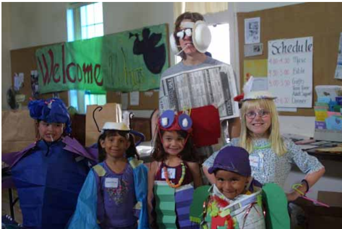
Below: Fish of all shapes and sizes and a hand-knit sweater from Guideposts Magazine.

What happens when you combine 20 kids, 35 adults, and a 40 foot inflatable whale? A whole lot of laughter!