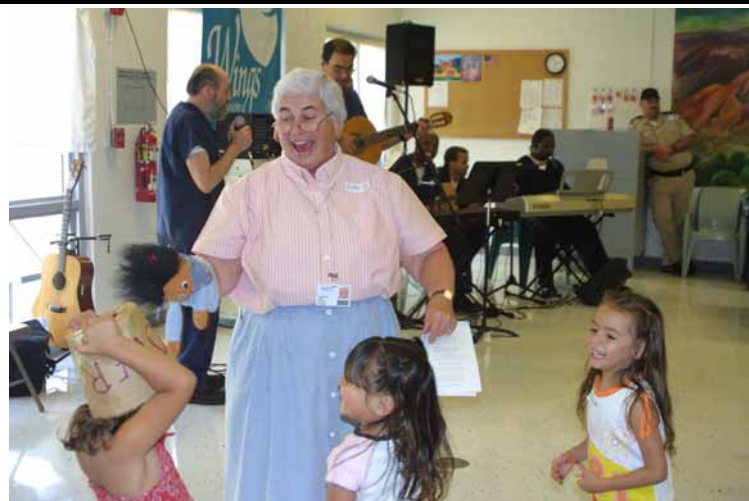
Bottom left: Family photos—a special gift from Wings.