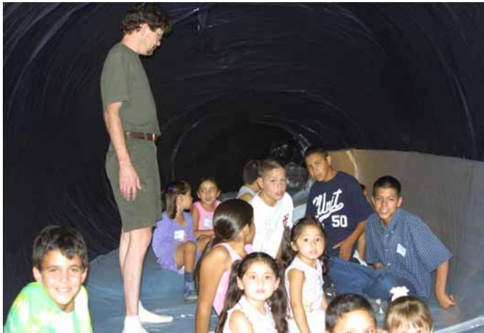
Above: Octopus, Angel Fish, and inside the whale!