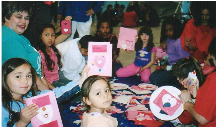
Above: Everyone is making Valentines for their loved ones.