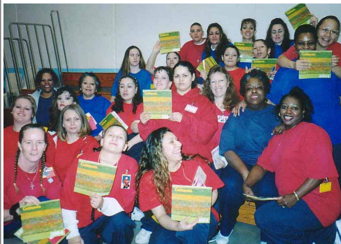
Above: Guideposts calendars held by inmates in the Grants prison during the Valentine's Day Party.