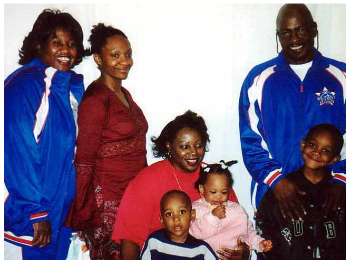
Below: A family photo taken at the Valentine's Day Party.

Special Appreciation and Thanks to All Our Donors