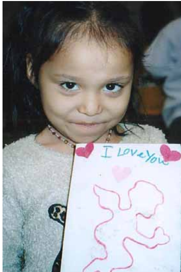
Valentines of Love.