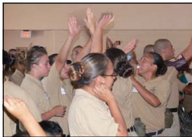
High-fives and singing