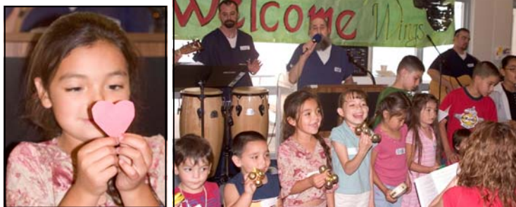
A reminder of Christ in her heart