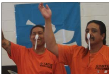
Spoon hanging fun at RCC