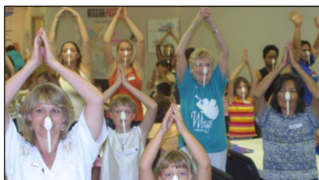
Everyone was surprised by their ability to hang spoons on their noses, even while moving and jumping