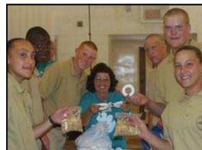
Youth ChalleNGe volunteers helped make treats & 'Frisbees'.