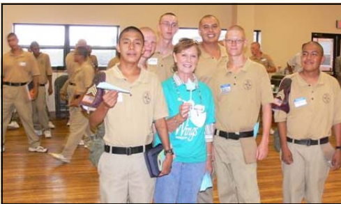
Paper Airplane Toss Winners