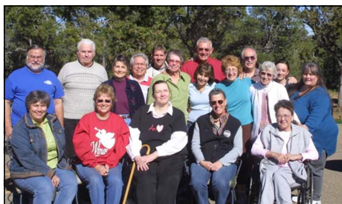
Wings Board Retreat at The Rekindling Retreat Center