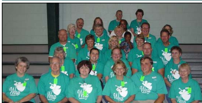
Wings volunteers from 7 states at the Mohican Juvenile Facility

The first Wings Party was held at the Mohican Juvenile Facility as part of Operation Starting Line for the State of Ohio on August 12, 2006. In attendance were 31 youth, 25 volunteers, and 54 family members. The volunteers came from the States of Ohio, Massachusetts, Indiana, North Carolina, Virginia, Colorado, and New Mexico. Youth helped lead the music. The Bible study was from the 6 th Chapter in John where Jesus told the disciples to "Not be afraid" in the storm when he walked on the water to them. A spoon hanging contest was held after dinner with a child, youth, and adult winner. There were many spoon hangers who were able to hang a spoon on their nose for over 5 minutes! Great fun was had by all. Special thanks to the Staff at Mohican.