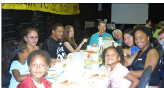
Talking about summer fun and favorite school memories over pizza and cookies