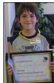
Teen Spoon Hanging Champ