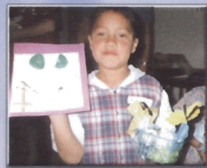
BIBLE STUDY — Easter collage