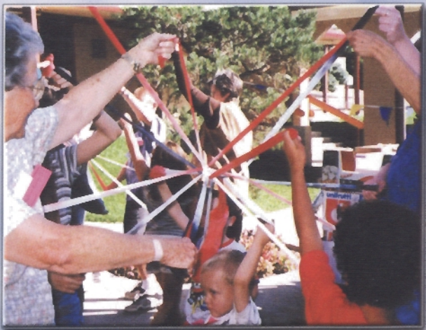
GAMES — Everyone participates

"I don't know who enjoyed it more, the volunteers or the families. Whatever prejudices they may have had about prisoner's families were bombarded. There was reconciling and healing."