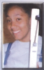
MUSIC — Chimes

"I believe that this particular program may provide one of the most effective outreach methods for our church. It is also a pleasure to do this."