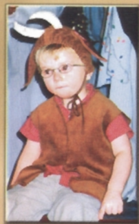
BIBLE STUDY — Littlest cow

The Wings Ministry strives to build quality relationships and strong values in teenagers. The Search Institute in Minneapolis has identified 40 developmental assets that are necessary for healthy growth. Wings provides an arena for effective ways to build assets in the lives of our young people.