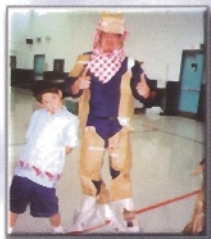
GAMES — New Cowboy Father's Day Outfit

"I don't know who enjoyed it more, the volunteers or the families. Whatever prejudices they may have had about prisoner's families were bombarded. There was reconciling and healing."