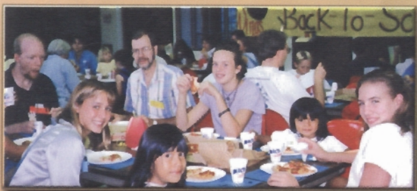
SHARING A MEAL — Pizza & new friends

Wings uses a model of nurturing ministry by building Christian relationships in a four-part experience following the example of the early church: Bible Study, Crafts and Games, Sharing a Meal, and Music.