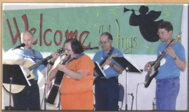
MUSIC — An inmate joins the band