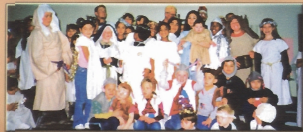
BIBLE STUDY — Christmas Live Nativity

The Wings Ministry strives to build quality relationships and strong values in teenagers. The Search Institute in Minneapolis has identified 40 developmental assets that are necessary for healthy growth. Wings provides an arena for effective ways to build assets in the lives of our young people.