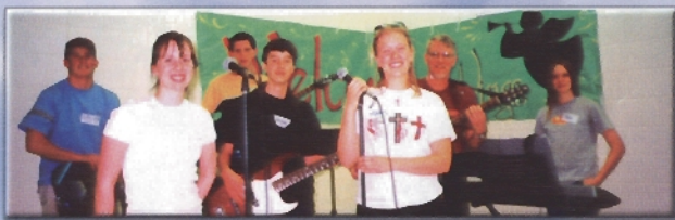
MUSIC — Teen band