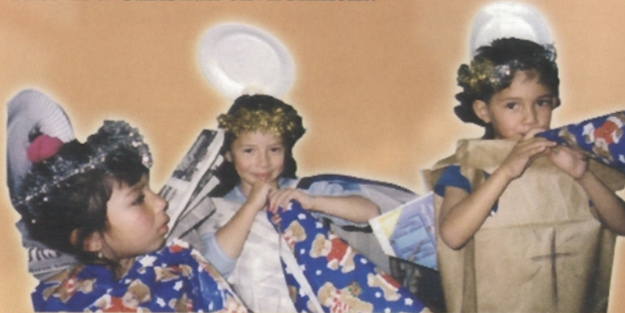
GAMES — Angels everywhere

The Wings Ministry generally hosts three parties a year: a Christmas , Easter , and Back-To-School Party , hoping to reach families at important times throughout the year. The parties are held in sponsoring churches in different parts of the city and in different denominations. All participants in Wings, whether they are inmates' family members or church volunteers, enjoy the interaction of Christians working together from many different denominations. Wings has recently expanded to holding events inside prisons , inviting families to join their loved ones in a Christian environment.