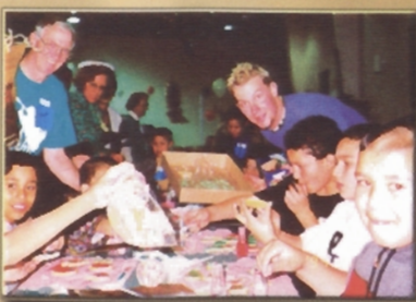
CRAFTS — Cards for loved ones