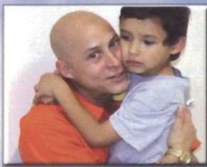
Father & son embrace