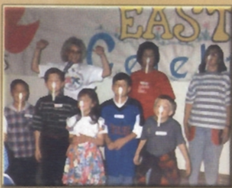
GAMES — Spoon hanging