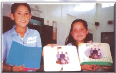
CARDS — Family photos & frames

"I believe that this particular program may provide one of the most effective outreach methods for our church. It is also a pleasure to do this."