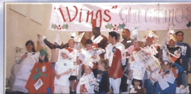
GAMES — Human Christmas Ornaments

"I tell you, just as you did it to one of the least of these who are members of my family, you did it to me."