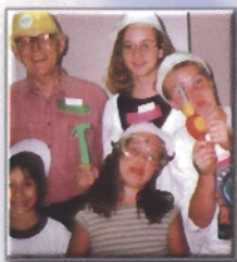
SHARING A MEAL — Table servers

"I think the program itself is a wonderful ministry that communicates such love and affirmation to persons who perhaps do not receive enough of it."