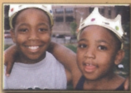
NEW FRIENDS — Building relationships